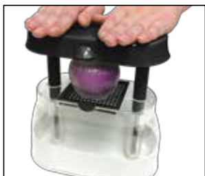
Dice fruit and vegetables.