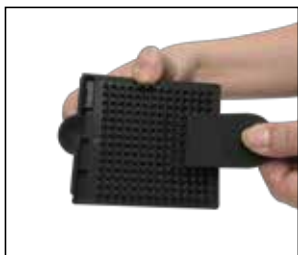
Use the Cleaning Tool to remove food residue from the Pusher Plates.