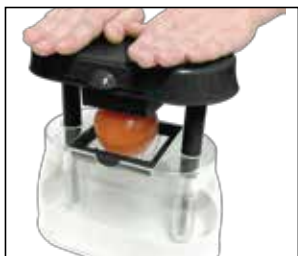
Slice fruit and vegetables.