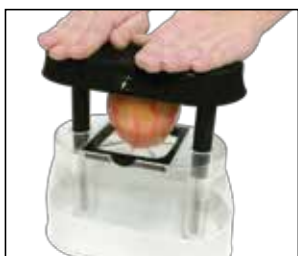
Core or wedge fruit and vegetables.